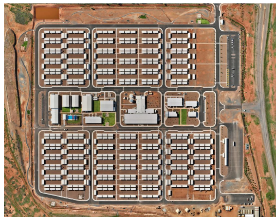
Bechtel Pluto Train II, near Karratha, Western Australia

Both scopes of the project were fully demobilized during the quarter.