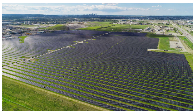
Barlow solar site, Calgary, Alberta, Canada

In June 2023, the Barlow solar project achieved full commercial operations. The Deerfoot solar project is expected to commence energization in the third quarter of 2023, with full commercial operations expected in the fourth quarter of 2023. Once fully operational, the Barlow and Deerfoot solar projects will be the largest solar installations in a major urban centre in Western Canada.